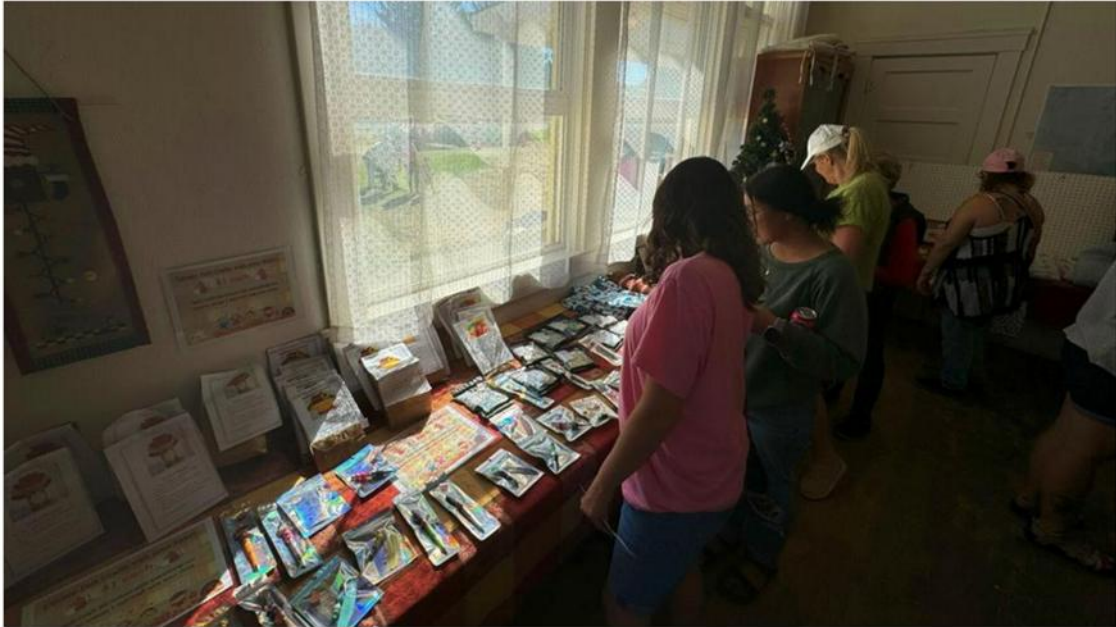
Lamoille Harvest Festival customers browse the Lamoille Rancher's Center, October 5, 2024.