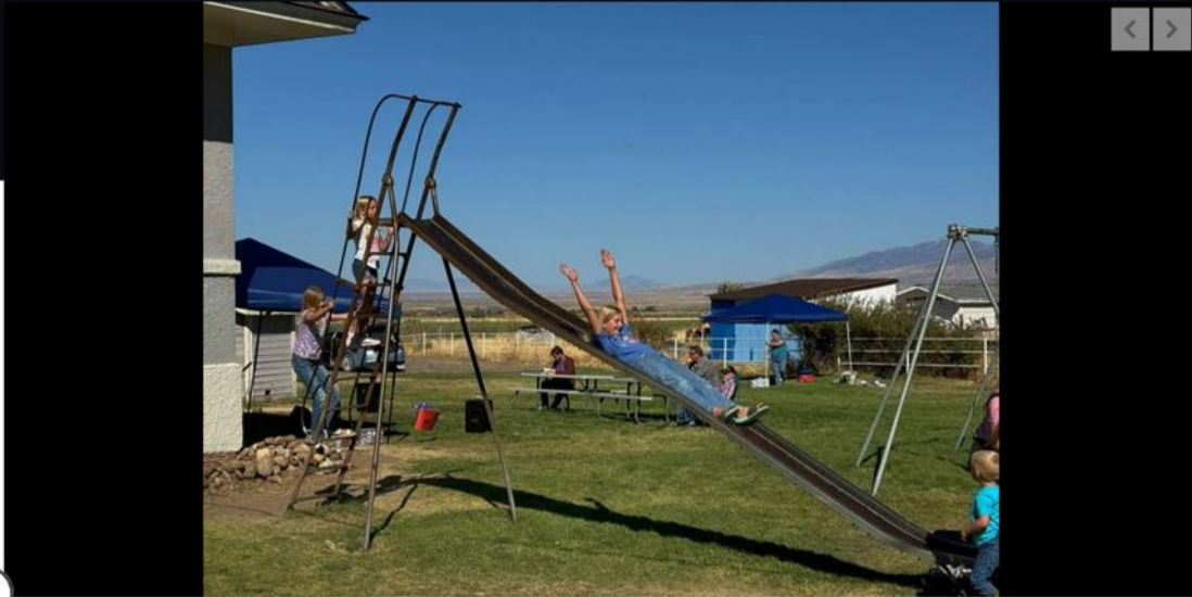
Children enjoy playground equipment at the Lamoille Rancher's Center, Oct. 5, 2024.

L AMOILLE — Each year, the Lamoille Harvest Festival attracts shoppers and families from around the Elko community to find gifts and entertainment.